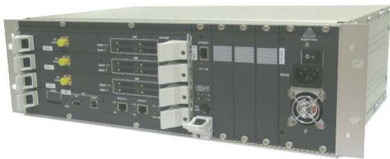
On-site Messaging API-based Unit

Enable sending and receiving of single and bulk SMS messages